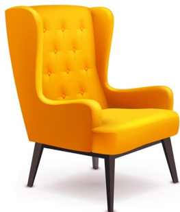
SARAH de ROUGEMONT UPHOLSTERY Established 1990

To advertise here email stevelthomas91@gmail.com